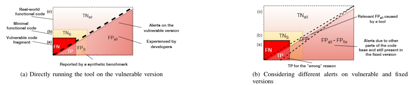
The tool output after analyzing a vulnerable version would likely contain many alerts not related to the analyzed vulnerability (Figure 1a). Such alerts should be also present in the tool output on a fixed version. Hence, the alert subtraction may significantly decrease the amount of irrelevant alerts (Figure 1b).